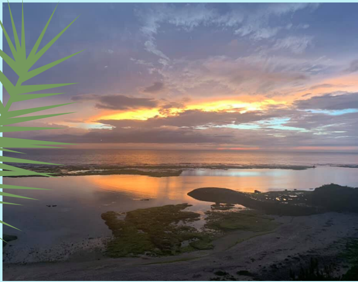
Photo of Sunabe Beach